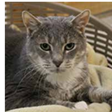
Zeva was admitted to LAPS after we found out she was going to be euthanized because she had Cerebellar Hypoplasia. Cerebellar Hypoplasia is a neurological condition which occurs when parts of the cerebellum are not completely developed. CH is a prenatal condition which affects fine motor skills, balance, and coordination. Cats with CH learn to adapt, often with an adorable wobbly walk, and since CH doesn't get worse, it certainly does not warrant euthanasia. Zeva lived at LAPS for 4 years until we discovered she had a tumor in her heart which restricted blood flow and caused labored breathing. Zeva was assisted across The Rainbow Bridge. She was approximately 7 years old.