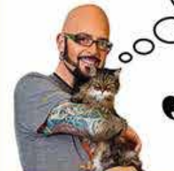
JACKSON GALAXY CAT BEHAVIORIST

“CLAWS ARE A PHYSICALLY, SOCIALLY AND EMOTIONALLY VITAL PART OF EVERY CAT.”