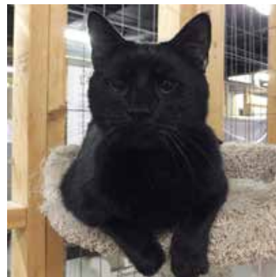
Bear Cub was returned to LAPS after his owners moved. He lived at LAPS for about 5 years, capturing our hearts with his sweetness. Bear Cub developed kidney disease on top of some ongoing heart issues and was assisted across The Rainbow Bridge when his fight became too difficult. He was 9 years old and is affectionately remembered for his macaroni toes and his fondness for water fountains.