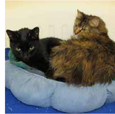
Sadie & Abe came to LAPS after being rescued from a colony. They were friendly cats who should have been pets instead of having to live outdoors. Both suffered from upper respiratory problems which went untreated while in the colony, causing irreversible damage to their nasal cavities. These two cats were strongly bonded and shared a room at LAPS. Over the years that they lived at LAPS, we tried every treatment and medication recommended by our vets, giving them small stretches of relief, but never a cure. In March, Sadie stopped eating and began to struggle to breathe. Sadie was assisted across The Rainbow Bridge at age 15. Abe grieved his longtime friend, and while all our volunteers went to great lengths to show him extra love and attention, he was having a difficult time. Three weeks after Sadie got her angel wings, Abe, who was 11 years old, began struggling to breathe and had to be assisted across The Rainbow Bridge. We like to believe Sadie and Abe are together once again and now they can breathe freely!