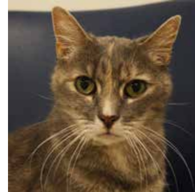
Tonya lived almost her entire life at LAPS after she was rescued from a colony as a kitten. In her later years, Tonya developed thyroid issues which were easily treated with daily medication. While medicating and feeding her, we noticed that Tonya's eyes were very dilated which can be a sign of high blood pressure in cats. Tonya was at the vet for testing and treatment, when she, sadly, suffered a heart attack and passed on her own. She was approximately 15 years old.