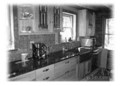
3<sup>rd</sup> Prize: $150 Gift Certificate to The Woodlands Resort, Wilkes-Barre

The Woodlands Inn & Resort is Northeast Pennsylvania's premier hotel and resort. Conveniently located near The Crossings Premium Outlets and Mohegan Sun at Pocono Downs, The Woodlands Inn & Resort offers three swimming pools, two outdoor lighted tennis courts, three onsite restaurants and numerous walking trails. Golf and skiing are also just a short distance away.