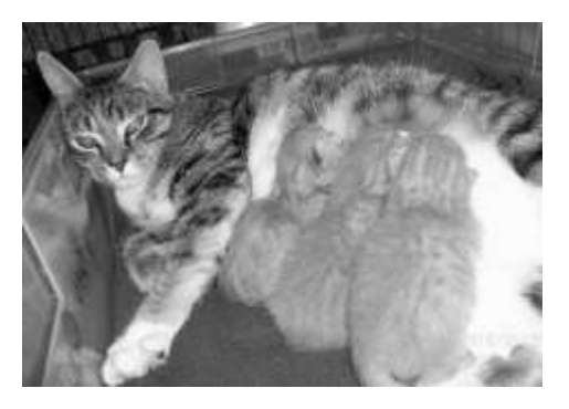
Gigi and kittens

Gigi gave birth to three orange kittens on Monday, January 25. When the kittens are old enough to determine their sex, names will be drawn randomly. If you wish to be notified that you were a winner and receive a picture of the kitten you named, please include your mailing and/or email address. You may either drop off your suggestion(s) at LAPS or mail to Attn: Name that kitten. Entry deadline is March 19.