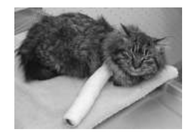
Miracle with her cast (above) and an x-ray of Miracle's broken leg (below).

In addition to the challenge of her physical mobility, Miracle has also challenged LAPS financially. The medical costs are overwhelming, and we are now facing vet bills which are above and beyond our normal budget. LAPS is asking for your help to put "Miracle in Motion." Donations toward her medical care would be greatly appreciated. Just mark your donation "Miracle" to help LAPS defray those costs.